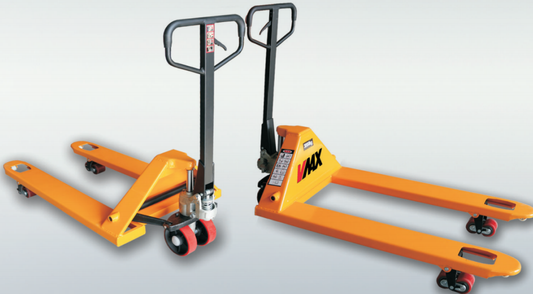
Hand Pallet Truck

VMAXUSA is a heavy equipment import company representing the best new technology in emissions free equipment. We are a USA owned and operated company, National Headquarters located in Butte, Montana. VMAXUSA provides customers with new options in heavy electric machinery. forklifts, scissor lifts, track scissor lifts, wheeled front loaders, excavators, mini front loaders, skid steers and more. Check out our new line of 2024 products for your lifting needs.